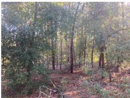
Withlacoochee State Forest parcel earmarked for land swap

This past June, without any public input, nor any discussion on the part of its members, the Florida Governor and Cabinet voted to approve transfer of 324 acres of land within the Withlacoochee State Forest in Hernando County to Cabot Citrus OpCo LLC, a Canadian corporation, to expand its adjoining luxury golf course/resort development in exchange for 861 acres of pine plantation in Levy County. It had obtained approval earlier from the Hernando County Commission to build 1770 residential units and a large area of commercial development on the land it already owns adjacent to this part of the Withlacoochee State Forest.