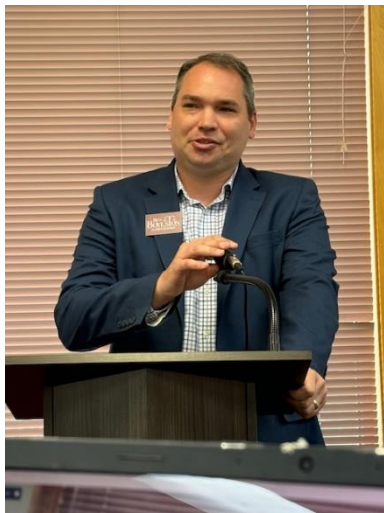
Fifth Circuit Judges, Group 20