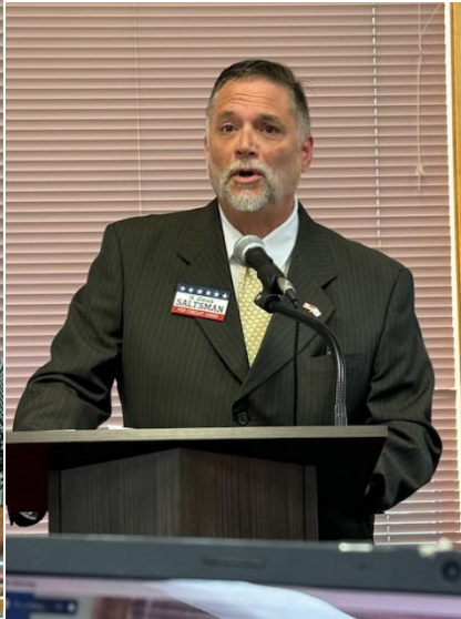
Fifth Circuit Judges Group 7