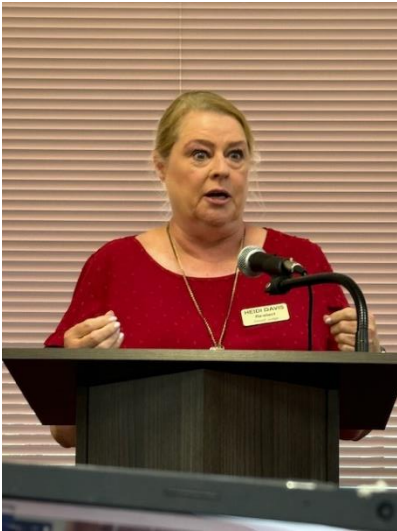
Fifth Circuit Judges Group 13